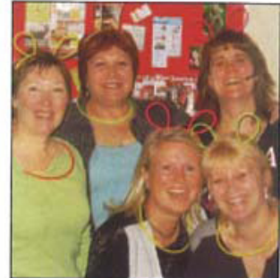
Secretaries at Anderson CVI donned the latest Earth Hour fashions on March 28th...glow in the dark!

A huge thanks to all the staff and students participating in the DDSB Earth Hour Challenge! Our students have seen how our actions can truly make a difference...one at a time!