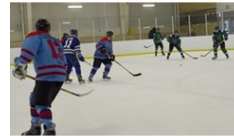
NEWS Feb 23, 2018 Niagara hockey players, former NHLers face off in Celebrity Ice Cup