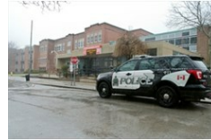
NEWS Feb 23, 2018 False alarm at Grimsby Secondary School