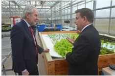
NEWS Feb 23, 2018 Niagara College a pioneer in growing marijuana industry: Harder