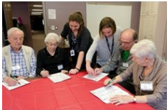
COMMUNITY Feb 23, 2018 Brain Wave Cafes offer support for dementia... One of the secrets to exercise is to make it fun. If you can enjoy yourself while working your muscles or stretching...